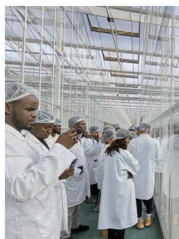
Photo of The Forth “The Belt and Road Initiative” Advanced Training Program